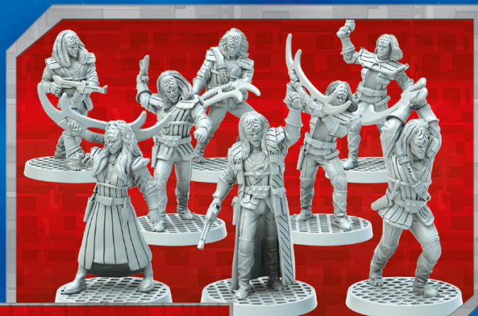
32MM MINIATURES KLINGON WARBAND