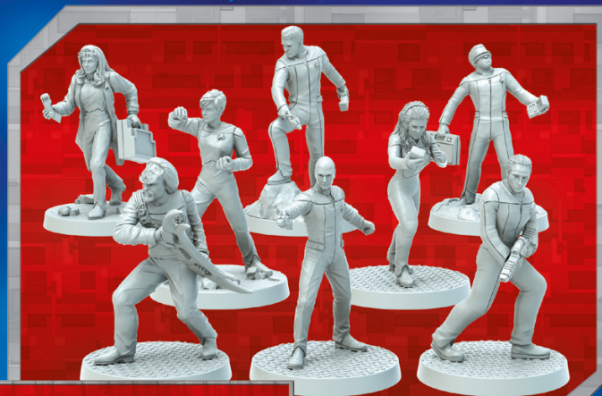
32MM MINIATURES THE NEXT GENERATION