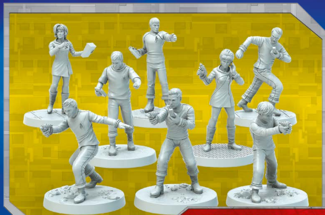
32MM MINIATURES THE ORIGINAL SERIES