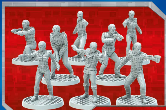
32MM MINIATURES ROMULAN STRIKE TEAM

ENHANCE YOUR ADVENTURES WITH SETS OF EIGHT 32MM HIGH QUALITY RESIN MINIATURES PLUS GEOMORPHIC FLOOR TILES TO RECREATE SHIPS, SPACE STATIONS, LOST COLONIES, AND ANCIENT RUINS!